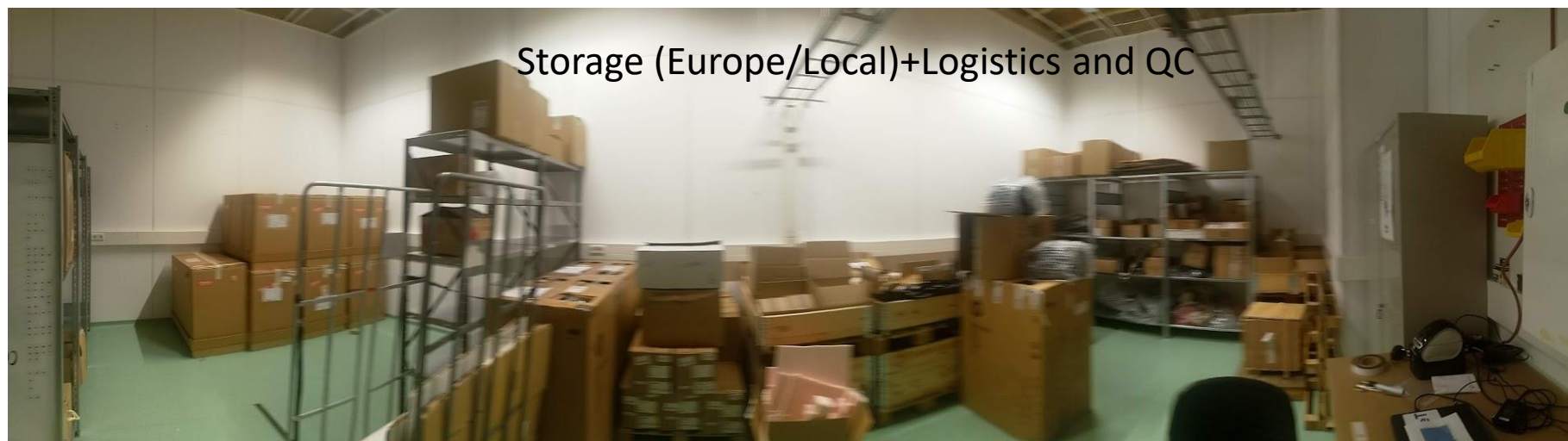
Storage (Europe/Local)+Logistics and QC